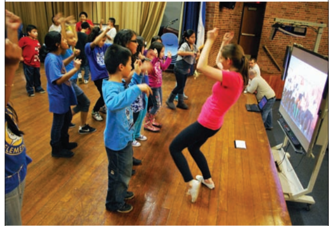
Dancing lesson at JFK School.

Through group exercise classes, walking programs, new gym facilities and state of the art equipment, the goal is to get people in motion.