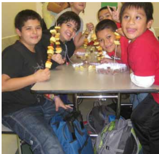
Kids with fruit kabobs.