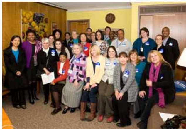
Staff and supporters of Open Door went to Albany to lobby for funding on Community Health Center Advocacy Day on March 7th.

The impact on Open Door is significant. At the Federal level, $500,000 due in 2011 is immediately at risk if Congress doesn't maintain current levels of spending. At the State level, cuts of nearly $300,000 are already certain. While Westchester County appropriated essential public health funds, thanks to pressure from the Board of Legislators, it has delayed issuing contracts for payment.